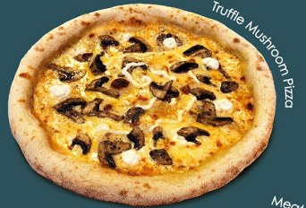
Truffle Mushroom Pizza

Squid, prawns, fish fillet, mozzarella cheese, gouda cheese and tomato sauce.