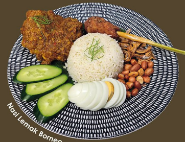
Nasi Lemak Borneo