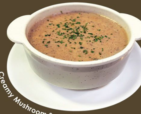
Creamy Mushroom Soup

BBQ Pulled Chicken, Mozzarella Cheese, Cherry Tomato, Sliced Ciabatta Bread and Salad.