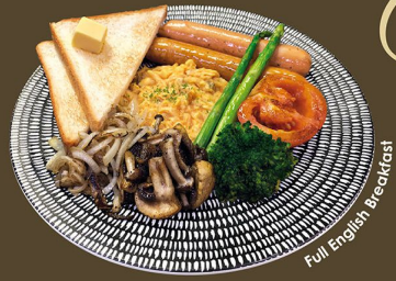
Full English Breakfast