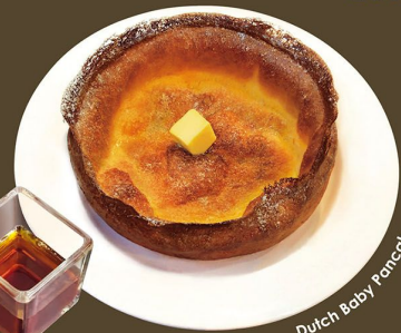
Dutch Baby Pancakes