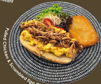
Pulled Chicken & Scrambled Egg Ciabatta