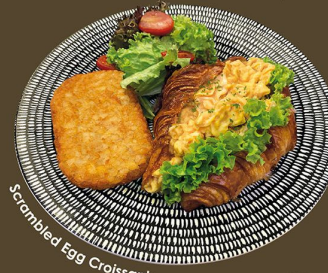
Scrambled Egg Croissant