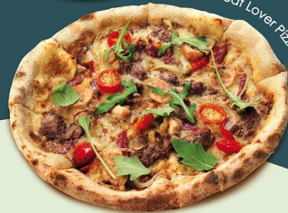
Meat Lover Pizza

Brown sauce, turkey ham, beef bacon, chicken sausage, chilli flakes, cherry tomatoes, mozzarella cheese and gouda cheese.