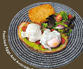
Poached Eggs And Avocado Toast NEW