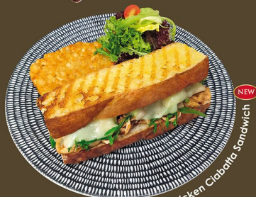
Bbq Chicken Ciabatta Sandwich NEW